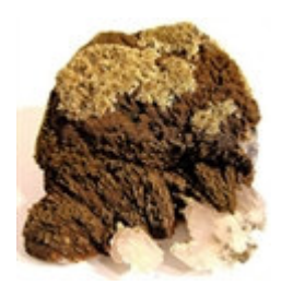
<u>Kutnohorite, Calcite</u> Kutnohorite & Calcite, Broken Hill, New South Wales, Australia