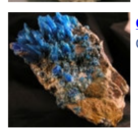
<u>Chalcanthite</u> Chalcanthite, Planet Mine, La Paz, Arizona, USA.